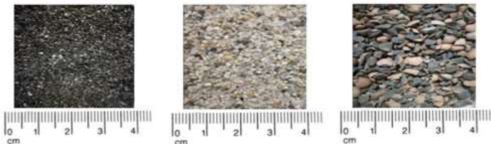
Figure 2. View of filtration media beds used in the

Activated carbon Sand filtration media bed Ceramic particle media bed filtration media bed